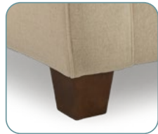
Dark Walnut • DW