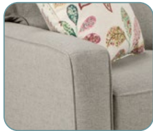
Track Arm • 2