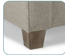
Riverloom • R