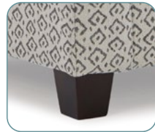
Espresso • E