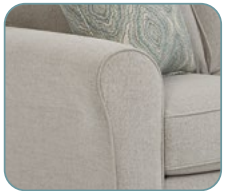
Sock Arm • 0